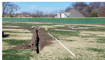
McDonald Stadium Irrigation