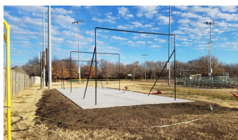
Central Park Batting Cage