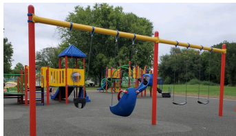
North Main Park Playground