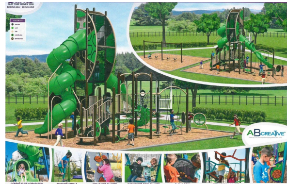
New playground equipment to be installed at Riverview Park.

Removal and installation of the playground will begin following the completion of the rip rap and hopefully be open by summer. Of course, the project(s) may be delayed if there is uncooperative weather or other issues arise during replacement of the rip rap or installation of the playground.