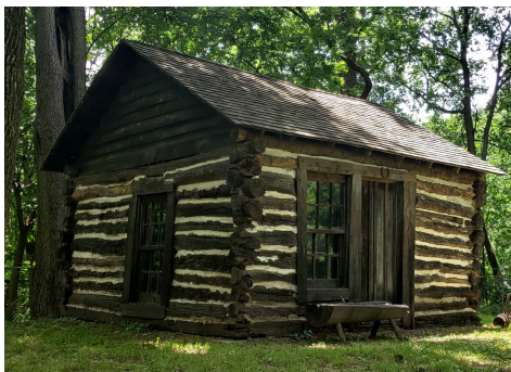
Conner Cabin 2020

This story does not end here. For more information and to see the cabin, go visit the Butler County Oil Museum. You can make reservations by contacting them at 316-321-9333.