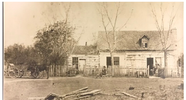
Mid to late 19th century, Conner Cabin, Butler County Oil Museum