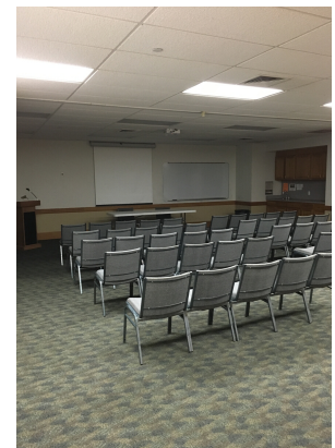
Civic Center Breakout Room