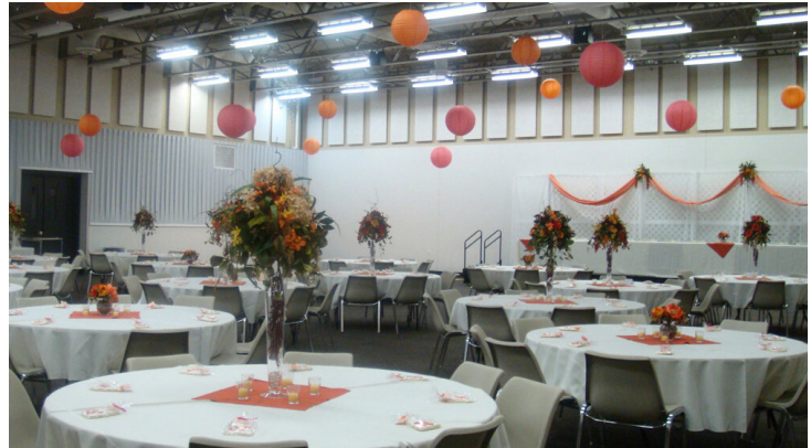
Civic Center Banquet Room

The following facility rates took effect for any date on or after January 1, 2020: