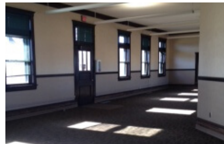
Train Depot West Side