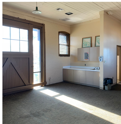
Train Depot East Side