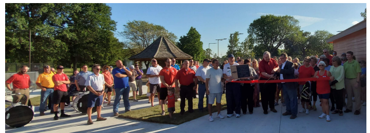
Sam Binter Tennis Complex