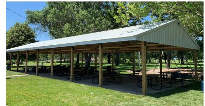
East Park Pavilion and Picnic Tables