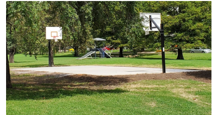
Basketball Court at Graham Park