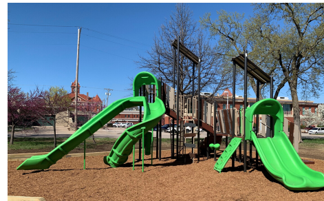
Gordy Park Playground Equipment

All past Excess Sales Tax Projects are displayed on the City website www.eldoks.com on the City Manager's page. The projects below have been funded with prior excess sales tax collections.