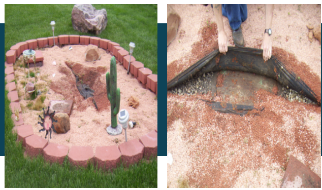
Manhole buried in a rock garden.

Utility easements are very important, especially when it comes to sewer lines. Manholes need to be accessible in order for us to flush sewer lines. Our goal is to respond to calls within 20 to 30 minutes.