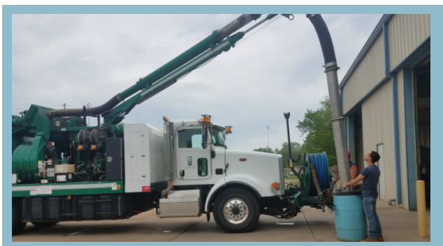
Combination Truck (Flush/Vac)

The City of El Dorado would also like to remind our citizens, we have endorsed the company, Service Line Warranties of America. Insure your Water or Sewer services lines for approximately $5/month.