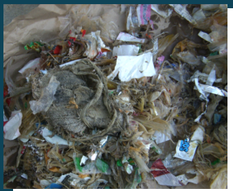
Trash collected from our sewer system.

To ensure the best possible service to our customers, please help us by putting trash in the trash.