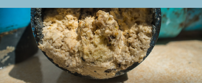
Grease is a frequent cause of sewer blockages/backups.

Blockages or even the collapsing of a home or business service line is frequently caused by tree roots that grow into service lines, blocking or crushing the service lateral. Removing trees that grow over the path of the service lateral can be effective in preventing problems. There are also chemical products that will kill tree roots, but won't harm the tree. Never Plant trees on top of or near sewer lines.