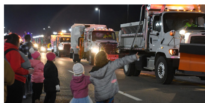
BELOW: The sanitation department received "best overall float" in the parade.