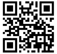
Scan for Survey

The City of El Dorado is continuing to seek input for the Transportation Master Plan Study survey. Residents are asked to take the survey and offer their comments through a drop-a-pin map, where you can mark any areas of concern, whether an intersection, street, etc.